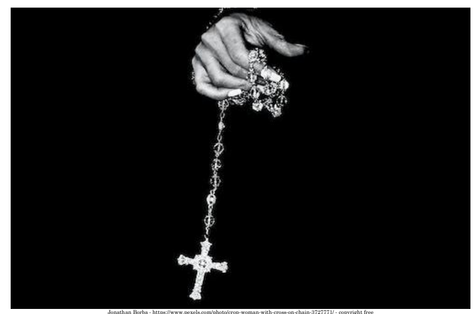
'If you love anyone more than me, you are not worthy of me. If you do not take up your cross and follow me,

you are not worthy of me. If you find your life, you will lose it. If you lose your life for my sake, you will find it.'