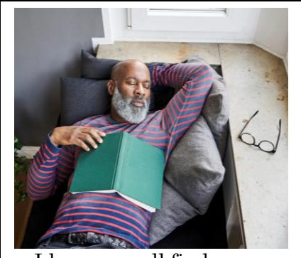
I hope you all find space this summer to have a well-earned rest & holiday.