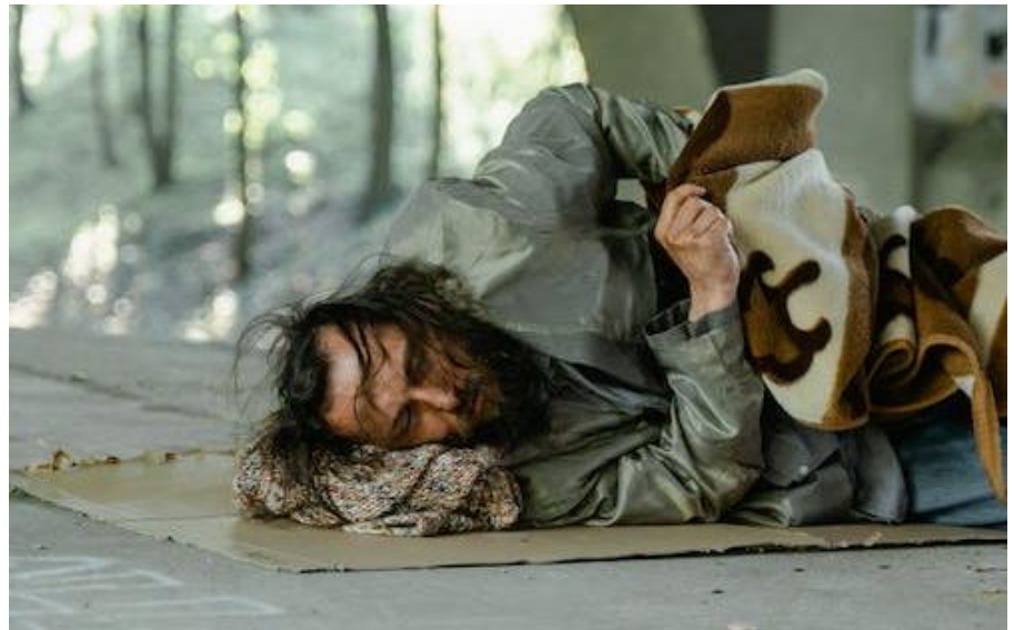
Photo by MART PRODUCTION: https://www.pexels.com/photo/man-in-green-jacket-lying-on-floor-8078366/ Copyright Fre