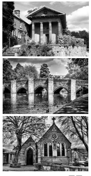
Emmaus Hub Every Moment Matters As You Serve

The Catholic Community of All Saints Catholic Church, Hassop, and Our Lady & St Joseph Catholic Church, Matlock