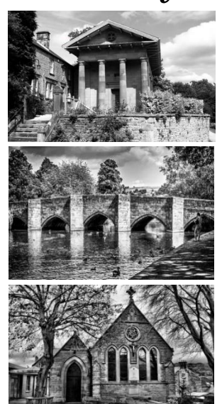
Emmaus Hub Every Moment Matters As You Serve

The Catholic Community of All Saints Catholic Church, Hassop, and Our Lady & St Joseph Catholic Church, Matlock